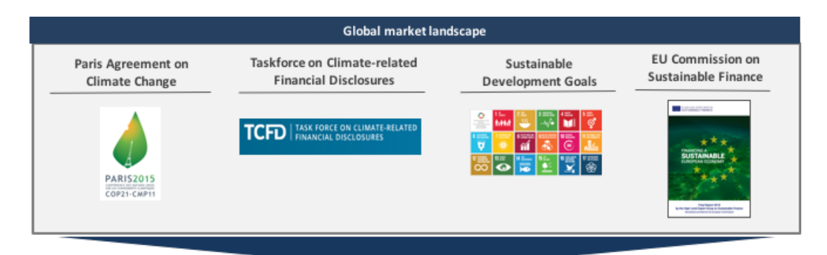
Figure 1: Key drivers of change in Responsible Investing and Sustainable Finance both globally and in the UK

Key drivers of change in responsible and sustainable finance