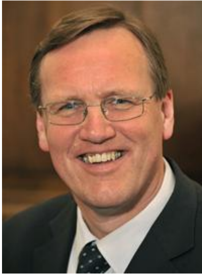
COUNCILLOR PHIL DAVIES LEADER OF THE COUNCIL