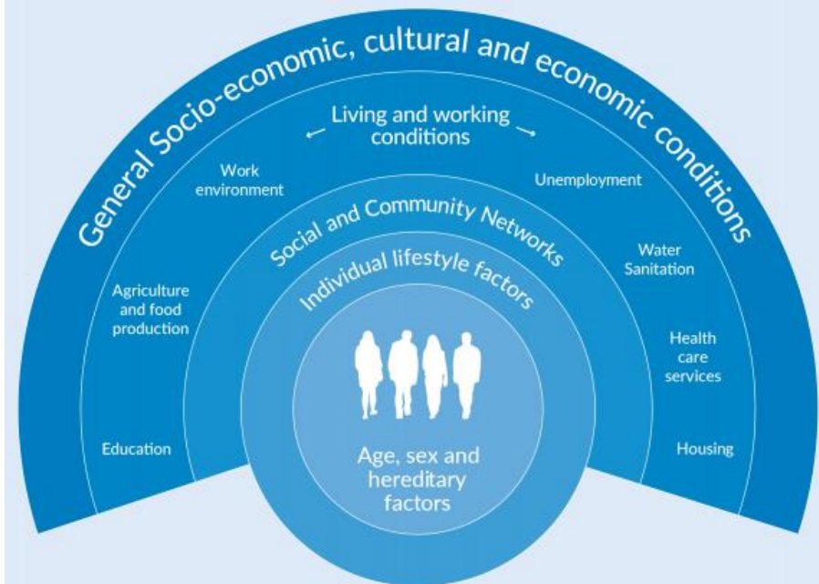
The Dahlgren and Whitehead Health Determinants Model (1991)

This diagram shows how these factors interact.