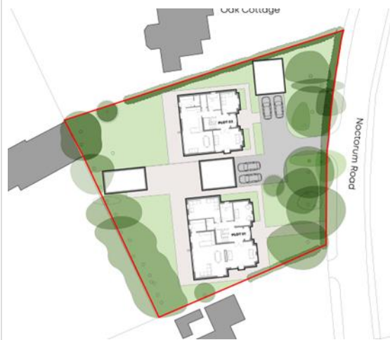
Fig.2: Refused planning permission APP/22/00500 for two detached dwellings.

2 The proposal is considered to harm the amenity of the neighbouring properties, specifically the proposed first and second floor balconies and the scale and proximity of plot 2 adjacent to Oak Cottage, and therefore conflicts with Wirral Unitary Development Plan Policy HS4 and the National Planning Policy Framework.